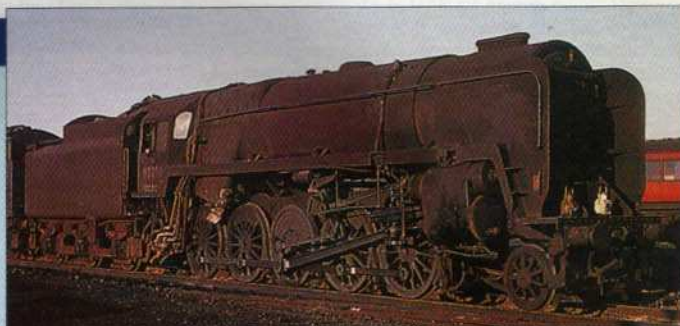
Above: BR 9F No. 92250, last in the series, was also an experimental loco, being fitted with a Giesl ejector designed by the Austrian Dr Adolf Giesl-Gieslingen, in an attempt to increase the boiler's steaming capacity without increased back pressure. The blastpipe inside the smokebox was formed of a series of nozzles. Built in 1958 at Crewe, No. 92250 – pictured at Oxley in January 1966 – underwent extensive testing at the Rugby test plant attended by Dr Giesl, but like the Crosti, the end results were disappointing and inconclusive. Success with the Giesl ejector was finally found after being fitted to 'Battle of Britain' class No. 34064 Fighter Command . Several 'Austerity' 0-6-0STs were also fitted with ejectors, and in preservation City of Wells and BR Standard Class 2 No. 78022 have run with the devices.