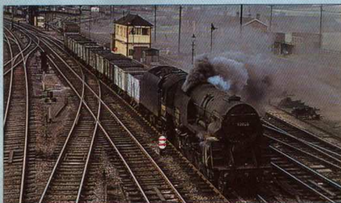
Right: With flush-sided streamlined casing more akin to an aircraft than a locomotive, Bulleid's ill-fated 'Leader' gets attention outside Eastleigh Works in 1949. By early 1953, national papers were headlining the scandal that despite more than £500,000 being spent on the locomotive, a not inconsiderable sum just after the war, it was a design disaster that had been left to rust in sidings.

AS late as the 1950s and 1960s, new locomotives being built under British Railways were the subject of experiments in a bid to improve efficiency. A batch of ten BR Standard 9F 2-10-0s, Nos 92020-9, were fitted with Franco-Crosti boilers which had water pre-heaters. The idea behind the design was that hot gases, after passing through the main boiler flues, were drawn backwards through the tubes of the pre-heater, heating the water before it entered the main boiler. Several similar pre-heating experiments had been tried over the preceding 50 years. The conventional chimney was only used for lighting-up purposes. The lack of any real benefit prompted BR to consult André Chapelon before they were converted back to conventional operation. Here, No. 92028 emits a plume of black smoke from the chimney half-way down the right-hand side of the boiler as it shunts coal wagons at Finedon Road, Wellingborough, in July 1959.