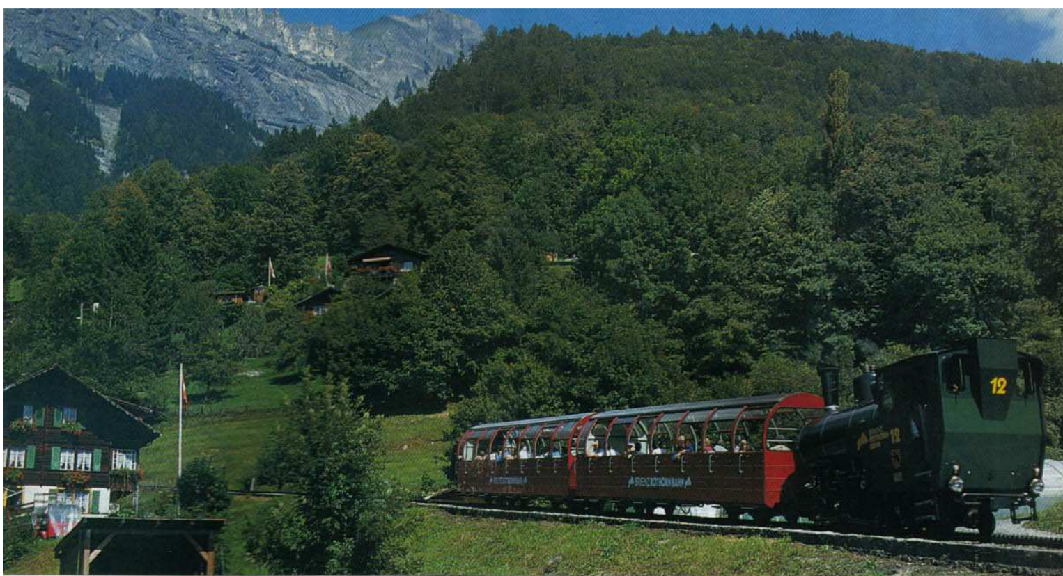
The BRB's prototype 'new' steam loco No. 12 makes no exhaust as it storms up the 1-in-4 on the outskirts of Brienz towards the mountains in this typical Swiss landscape. CHRIS MILNER.

conventional-looking steam locomotive, running on light oil, which would out-perform existing diesel locos of equivalent size and gauge and whose trains would require only a driver and a guard.