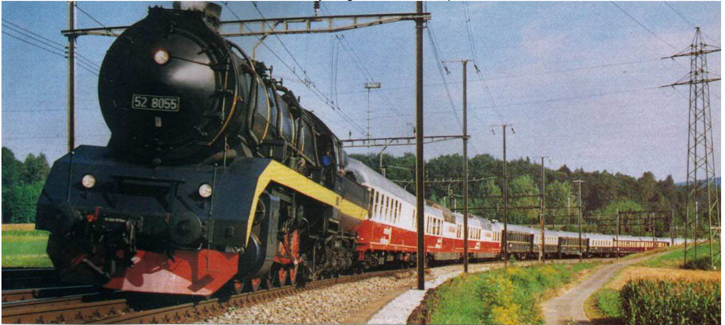
The brave new world of steam ... this is the Class 52 'Kriegslok' which has been rebuilt by Sulzer as a prototype for a new generation of ultra-efficient steam locomotives. No. 52.8055 is seen near Einfahrt Hendschiken on August 1, 1999 with the 'Nostalgie Orient Express'. NICOLE MANSKE.