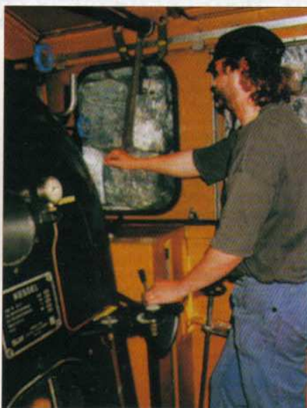
Left: The cabs of SLM's new narrow gauge steam locos are clean and tidy without the clutter of piping normally found in loco cabs. The driver has his right hand on the regulator and his left is on the oil control valve. SLM.

So how is such a one-man machine driven? From the right-hand position, the driver works the loco with one hand on the regulator and the other on the oil feed valve. Other controls immediately to hand include a brake valve, drain cocks and the injector feed controls. Behind the driver is an additional set of controls used only during the descent. What is particularly noticeable is the uncluttered appearance of the cab; there is no