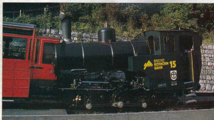
Left: A close-up of the Brienzer-Rothorn Bahn's SLM-built 0-4-2T No. 15 – which uses new steam technology – leaving Brienzer station on September 8. It's hard to believe that this loco is just three years old.

Sulzer now owns the former Swiss Locomotive and Machine Works (SLM), and recently sold part of the site to Adtranz. Sulzer retains the SLM name and under that, has built eight narrow gauge steam locomotives for Swiss and Austrian tourist lines. These use methods and technology which not only make them more efficient, but increases their power output so much that they can compete with diesel or electric locos of similar size.